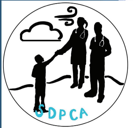
AAP-CA3 Climate Change & Health San Diego Pediatricians for Clean Air