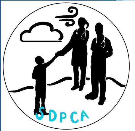
AAP-CA3 Climate Change & Health San Diego Pediatricians for Clean Air